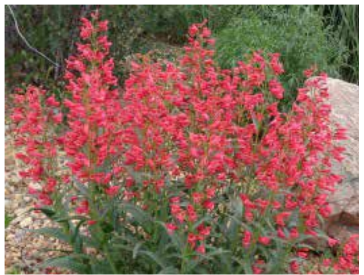
Penstemon x 'Coral Baby'

Coral Baby penstemon was discovered as a chance seedling by Kelly Grummons, Arvada, most likely a cross with P. barbatus (Western US species) and other species growing in his nursery. In trials, Coral Baby bloomed nearly all summer long with full, 18-18" compact spikes of coral-pink tubular flowers. It blooms heavily in container plantings, as well.