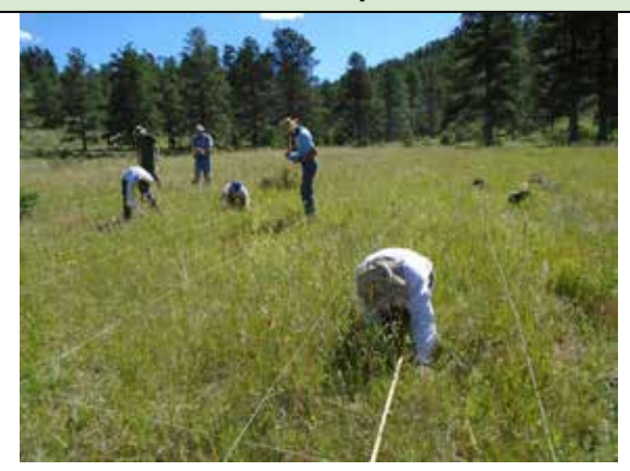
Counting plants in the study plots

surveys uncovered "satellite" (e.g. isolated) occurrences outside of the main infestation which led to questions about dispersal mechanisms. Unlike so many other noxious weeds, P. rect a does not appear to be disturbance related or dispersed along roads. The current theory is that seeds are carried in the hoofs of animals during wet periods.