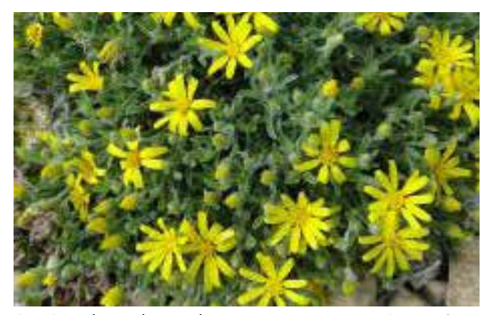
Heterotheca jonessi x villosa 'Goldhill' Goldhill Golden-aster

Ray Daugherty, horticulture instructor at Front Range Community College, found this naturally occurring hybrid of H. villosa & H. jonesii near Gold Hill outside of Boulder. It was the top winner in trials at CSU 2 years in a row, and was introduced through the Plant Select® Petites program. It forms tight mounds just 1-2" tall and 5-10" wide, producing small yellow flowers from spring to mid-summer. The grey, fuzzy foliage is nearly evergreen.