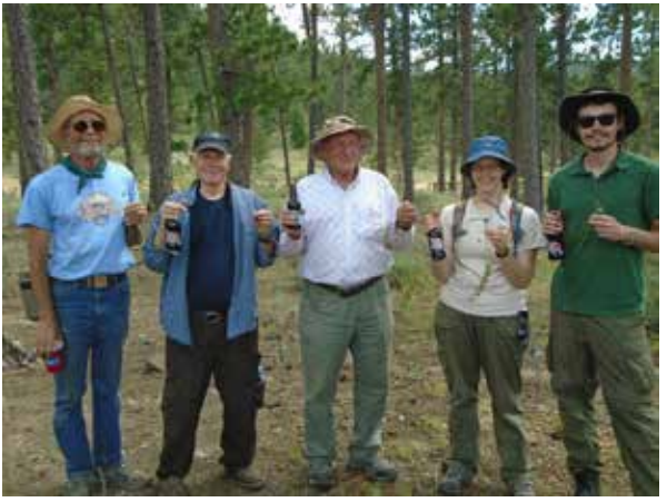
Winners of the root digging contest

As the summer proceeded, the committee started learning more and more about the ecology of sulphur cinquefoil. Surveys were conducted that expanded knowledge of the local population area some 20 times. Ultimately,