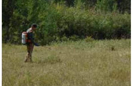
Larimer County Weed Crew member spraying Sulphur Cinquefoil along Elkhorn Creek

are included in case landowners wish to manage them locally. List C species include the ubiquitous cheatgrass (Bromus tectorum) and mullein (Verbascum thapsus).