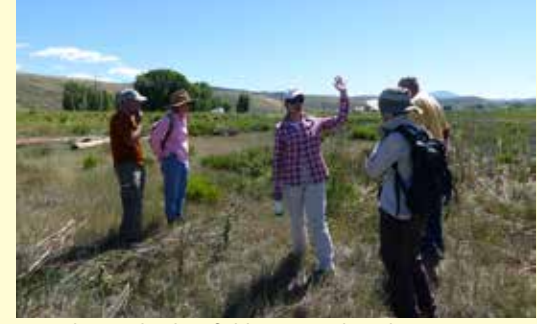
Barb Frase leading field seminar

Almont Triangle Aspen Exclosures by Barb Frase , PhD, Western State Colorado University. The Almont Triangle is a protected big game winter range a 20 min drive north of Gunnison. We'll walk through rolling sage covered hills on a dirt road. It's an easy uphill grade and we'll stop often because there is so much to