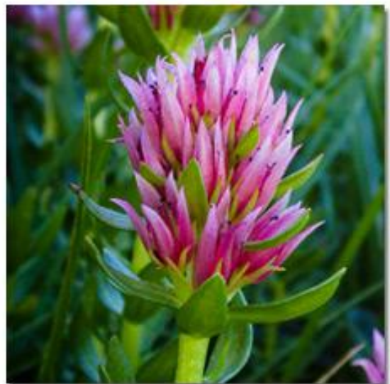
Rhodiola rhodantha (detail)

Southeast Chapter meetings are held from 6:30 p.m. to 8:00 p.m. All meetings, unless otherwise noted, will be held at the 701 Court Street in Pueblo. For more meeting information, please call Warren Nolan: (719) 543-6196.