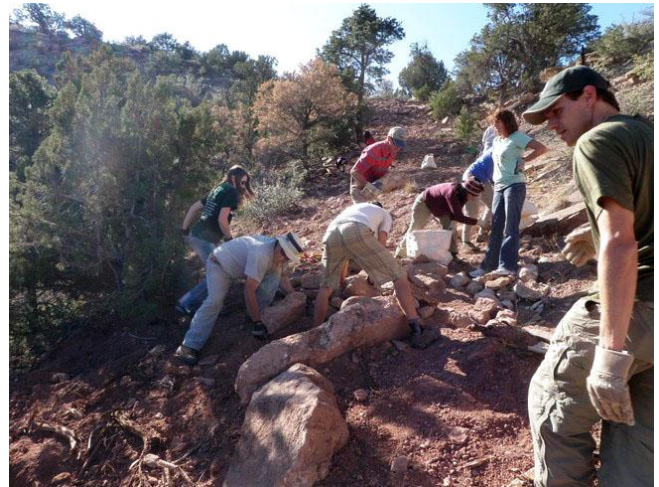
“Obliterating the Roads”

On October 21 st over 50 citizen scientists showed up. They came from CoNPS, from the Wildlands Restoration Volunteers, from Brian's rare plant monitors, from local hiking groups and from the Gold Belt Tour Highway Association. In addition, eight students of the Cañon City High School Environment Conservation Club, with faculty adviser came to pitch in.