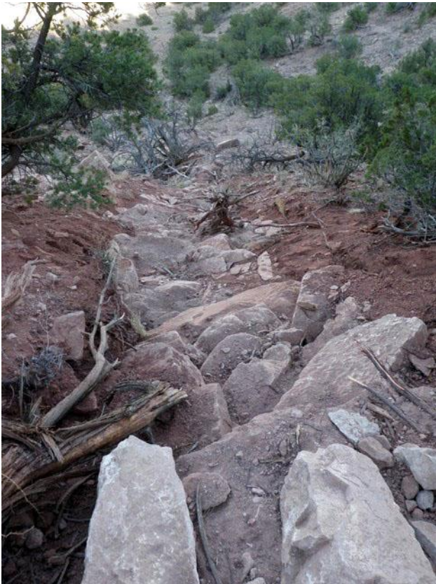
“An Obliterated Road”

In the summer of 2010 and again in the summer of 2011 the CoNPS citizen scientists collected seed from the Garden Park site to provide revegetation material for the project. The road obliteration was scheduled for October 21, 2011.