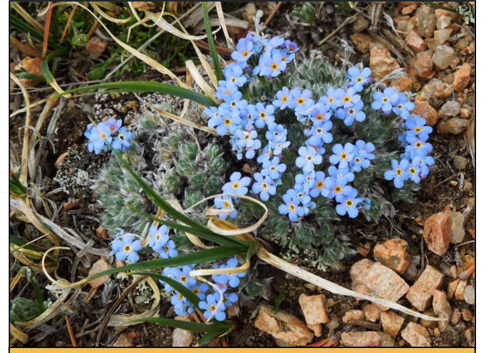
Eritrichium nanum var. elongatum (alpine forget-menot).