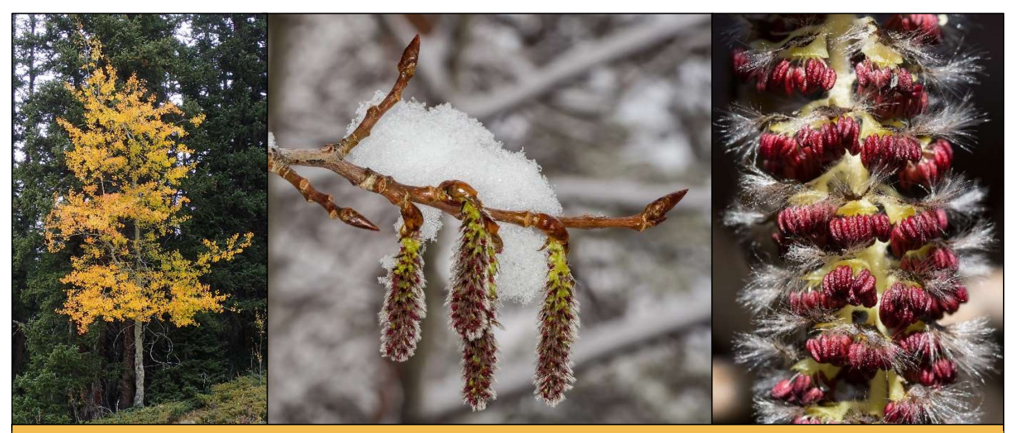
Aspen (Populus tremuloides) tree ; female catkins and male catkins.