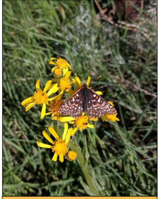
Field crescent butterfly ( Phyciodes pulchella ) on a ragwort ( Packera sp. ).

Wandersee recommends having a plant mentor in your life, or you can be the mentor. I am encouraged by the huge uptick in interest around houseplants.