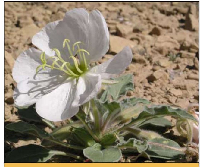
Morning Lily ( Oenothera caespitosa var. navajoensis ). © Arnold Clifford

Native plant species are utilized for supplemental food, food additives, seasoning, spices, and sweet treats from flower nectars. Hundreds of plants are