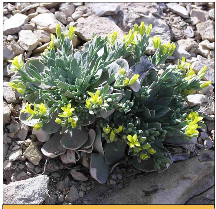
Physaria bellii (Front Range or Bell's twinpod). © Georgia Doyle

CNHP conducts field surveys for rare native plants; designs and implements monitoring studies; produces models, best management practices, and conservation strategies; and develops detailed maps