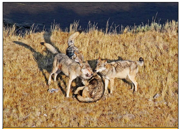
Forty-one gray wolves were introduced to Yellowstone National Park from 1995 to 1997. Their numbers tripled during the first few years, then settled to about 100 wolves in the park since 2009. If Proposition 107 is passed, wolves would be reintroduced to Colorado by the end of 2023 with the numbers of introduced wolves yet to be determined.

Those of us who are passionate about our native plant species and plant communities, and who have spent considerable time on our public lands, have undoubtedly observed widespread degradation to these communities by wildlife and livestock grazing. In places of heavy grazing, plant community diversity is low and the composition of introduced plant species is often high. Add the potential impacts of climate