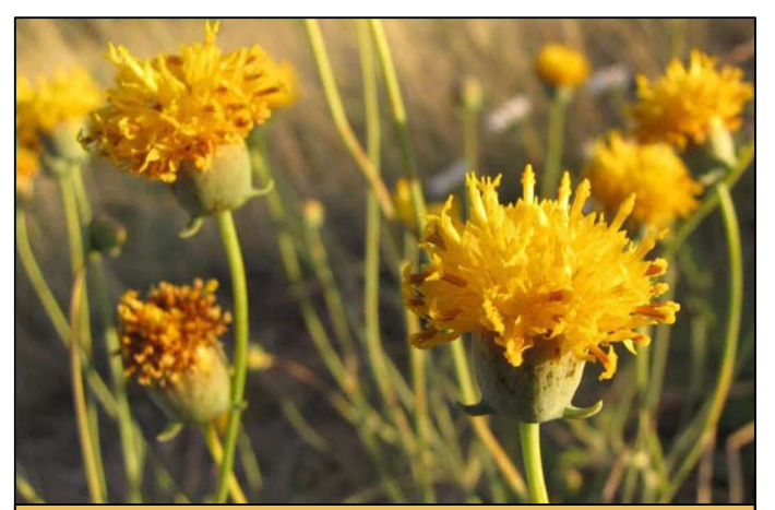
Navajo Tea ( Thelesperma megapotamicum).