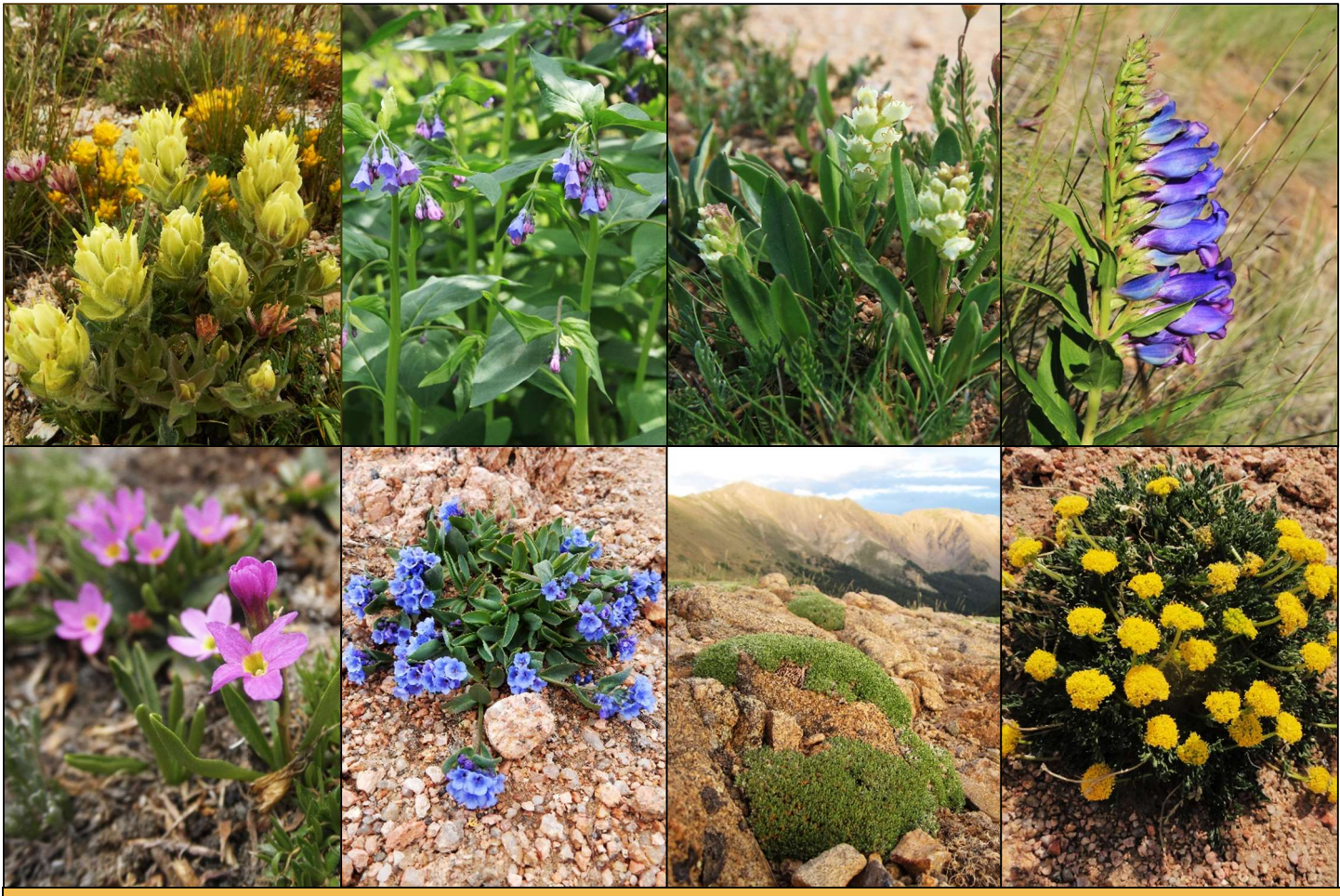
Clockwise, from upper left. Castilleja occidentalis Torr. (Western Indian paintbrush), Mertensia ciliata E. James ex Torr. (alpine bluebells), Chionophila jamesii Benth (Rocky Mountain snowlover), Penstemon glaber var. alpinus Torr. A. Gray (alpine sawsepal penstemon), Cymopterus humilis (Pikes Peak alpine parsley, Paronychia pulvinata A. Gray (Rocky Mountain nailwort), Mertensia alpina Torr. G. Don (alpine bluebells), Primula angustifolia Torr. Raf., (alpine primrose).

most costly forest fires in Colorado's history, both since 2012.)