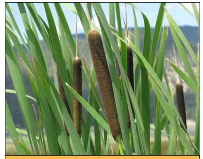
Broadleaf Cattail ( Typha latifolia ).

Numerous species of trees, shrubs, grasses, and flowering, herbaceous forbs are used for different aspects and rites of Navajo ceremonials and chants. Plants designated for ceremonial use are employed to make ceremonial implements and paraphernalia, ►