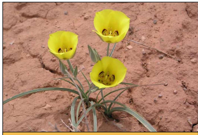
Golden Mariposa ( Calochortus aureus ).

Plant roots function in a similar way as they break down and draw up vital nutrients, minerals, elements from the soil to distribute into all parts of the plant, to give plants life. The Navajo "Holy Plant and People" ►