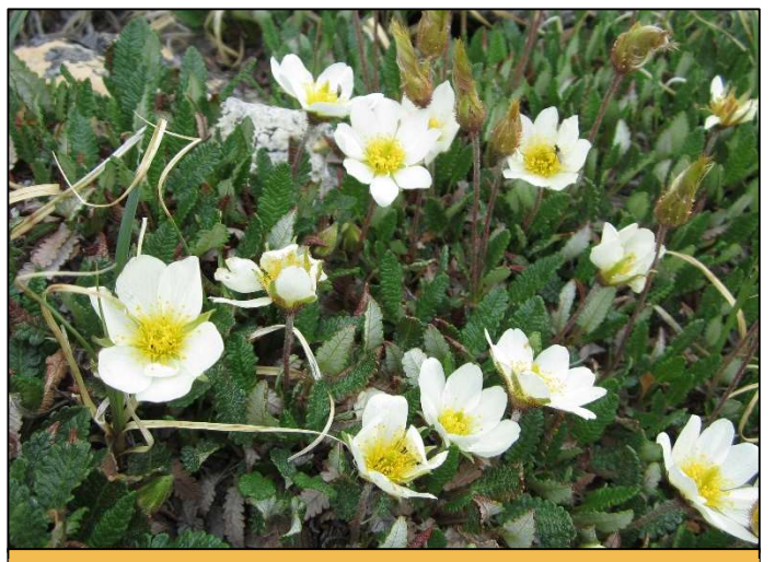
Dryas octopetala (mountain dryad).