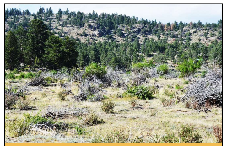
A view of what was once a lush riparian willow carr in Rocky Mountain National Park. Heavy competition between elk and beaver forced the beaver to leave, resulting in a drop in the water table and ultimate death of the willows. What was once home to a thriving community of neotropical migrant birds such as the MacGillivray's and Wilson's Warblers, and plants such as the wood lily, is no longer existent.

Proposition 107 is likely to succeed. According to a recent statewide survey completed earlier this year, ►