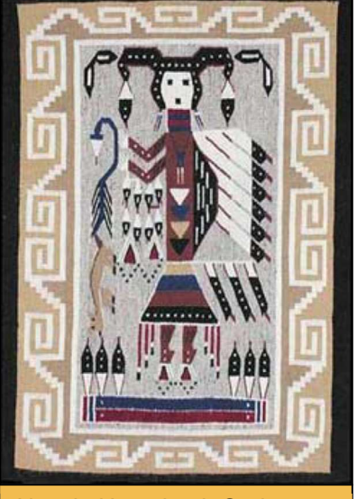
Navajo Humpback God weaving. © Zonnie Gilmore

white zigzag all the way around the rim. The black represents night time clouds, with the white zigzag depicting lightning strikes between adjacent dark clouds. Standing upright around the rim of the baskets are numerous red flicker or red woodpecker feathers. The feathers represent sunbeams shining through clouds immediately after rain. On top of the basket are two bluish horns that represent dark clouds before and during rain. The whole head piece is a crown of thunder, lightning, and rain. Along the back is a rainbow with feathers attached along the crest. The feathers indicate sun rays radiating from the eastern horizon, and the rainbow indicates the presence of holy people and the blessings of rain. Under the rainbow is a dark, black sack with white bars. The hump contains mist, dew, frost, female rain, male rain, snow, all aspects of precipitation, and vegetation seeds of all types. Humpback Gods carry and walk with planting-stick canes.