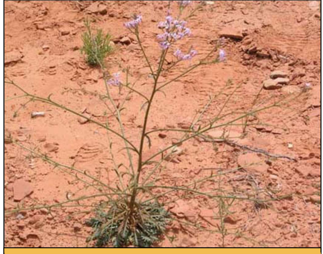
Clifford's Diné Star ( Aliciella cliffordii ). © Arnold Clifford

Navajos still utilize 1,500 or more native plant species; however, plant knowledge is declining. In the past Navajos had a vault of plant knowledge that included more than 3,000 to 4,000 plant species occurring within the Colorado Plateau. Six different plants are