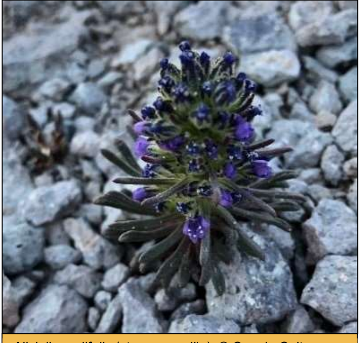
Aliciella sedifolia (stonecrop gilia).

CNHP tracks the location and condition of over 500 imperiled plants. Tracking and monitoring efforts guide effective management and protection of those species and thereby prevent extinctions or statewide extirpations of Colorado's native plant species. ►