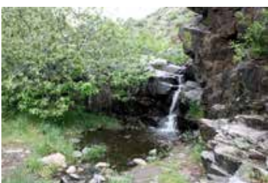
Photo of Wells Gulch